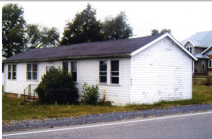
Mt. Carmel School building, 2015, before it was demolished.