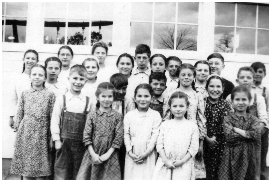
Mt. Carmel students, 1945-46.