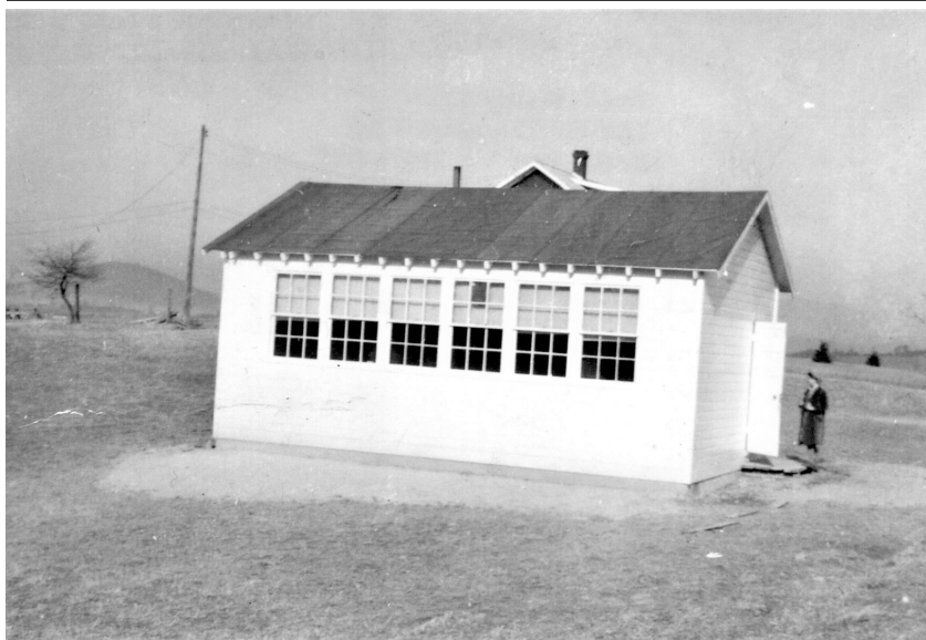
Mt. Carmel Parochial School, 1944, Harrisonburg, Va.

He was asked to serve as president of Hesston College—which he declined. He was involved in the establishment of Eastern Mennonite School from its earliest beginnings and served as its president from 1922 until his death in 1934. 2