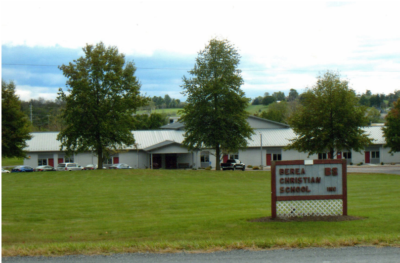
Berea Christian School, 1350 Garbers Church Rd., Harrisonburg, Va., is a K-12 school that is operated by Southeastern Mennonite Conference, and was founded in 1988.