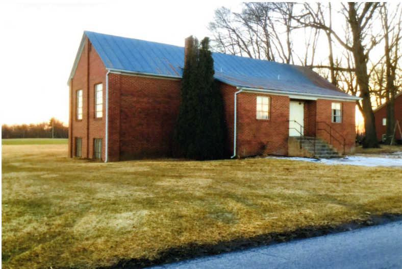
Bank School, next to Bank Mennonite Church, Dayton, Va., 2018.