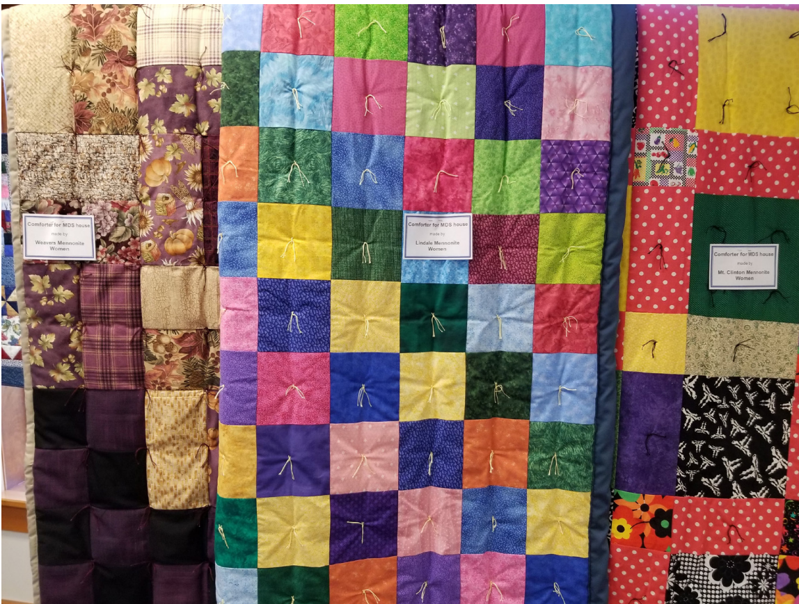
Comforters displayed at the VMM Centennial gathering, July 18, 2019. They were made for a Mennonite Disaster Service house, sewn by Weavers Mennonite Women (left), Lindale Mennonite Women (center), and Mt. Clinton Mennonite Women (right).