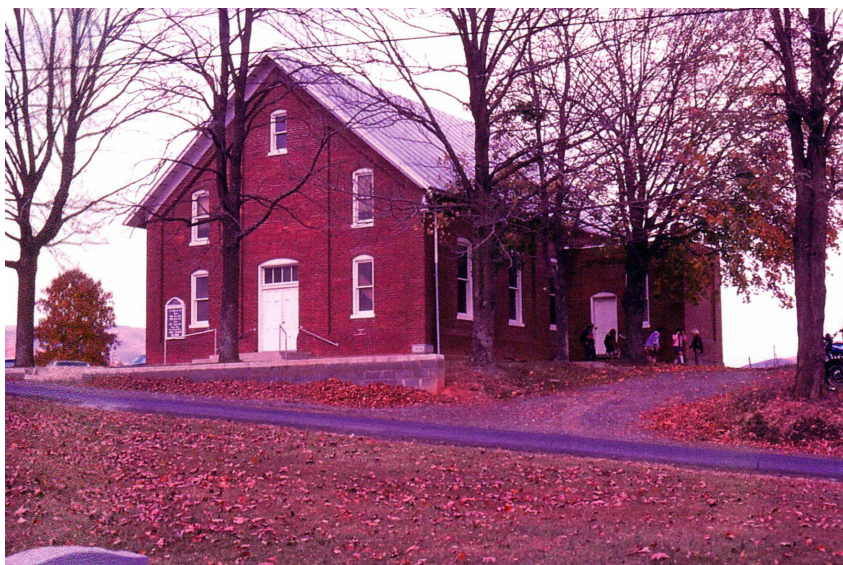
Mt. Clinton Mennonite Church building, 1916-1989. A fire destroyed the structure April 14, 1989. Photos of the church today are on the front and back of this issue.