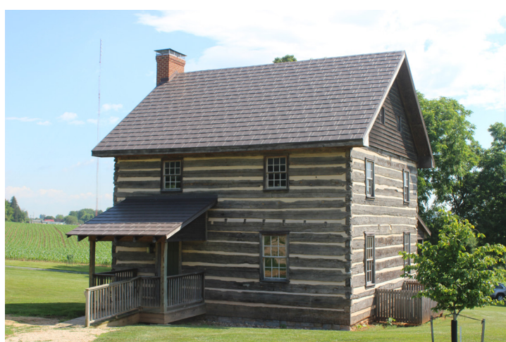
The 1829 Weaver-Brunk house, located at the Brethren Mennonite Heritage Center on Garbers Church Road, Harrisonburg, has a new display, upstairs, called "A Mixed Legacy: The Brethren and Mennonite Record of Racial Separation and Connection."

The exhibit opened on May 22, 2022. You are encouraged to stop by the Heritage Center on Garbers Church Road, Harrisonburg, and visit the exhibit. It's well worth your time to visit as this is an important historical marker for Brethren and Mennonites.