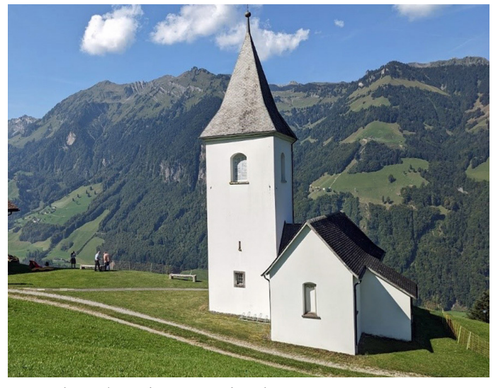
St. Joder Chapel, Switzerland.