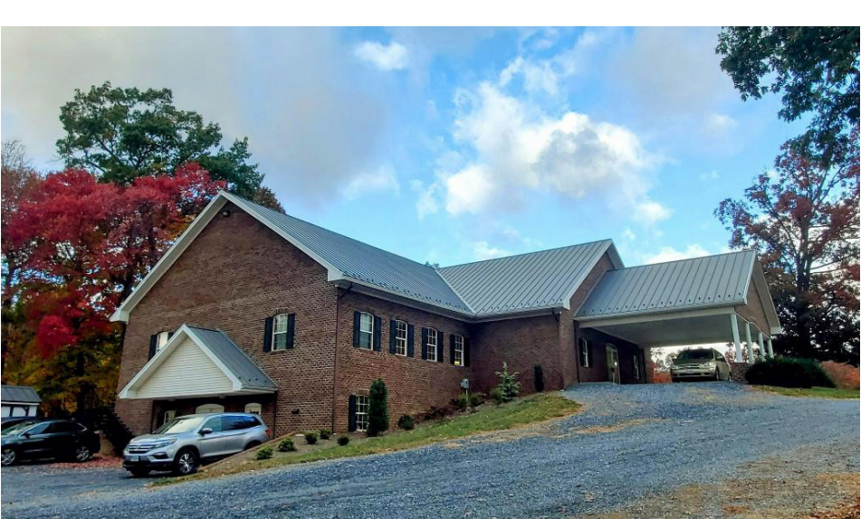
Peake Mennonite Church, Rockingham County, Virginia, 2023.