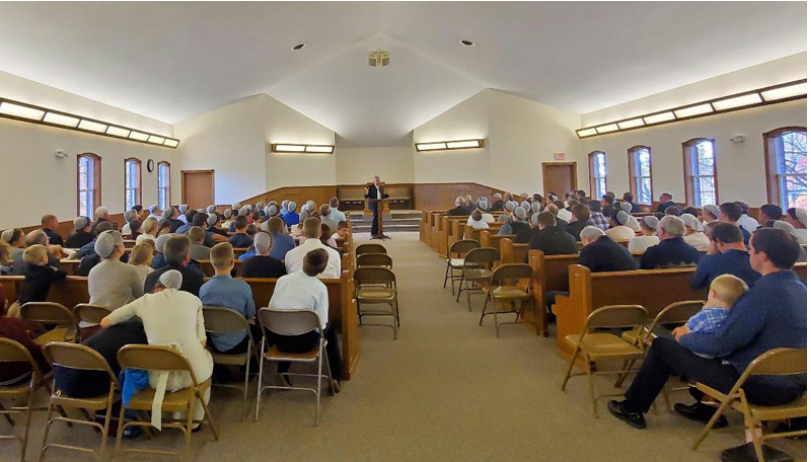
Peake Mennonite Church, October 22, 2023.

The population of the Peake community was mixed with black and white families living there. Family names of African Americans who lived in the Peake community are Spinnard, Madison, and Harris. Black families had lived in the Peake area from the years before the Civil War when they were enslaved. In the 1920s, the State of Virginia had strict 'Jim Crow' laws, which were intended to segregate society and force blacks and whites to