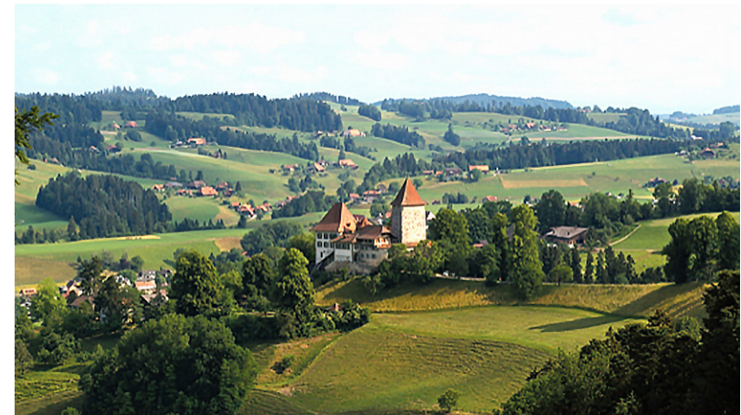
Trachselwald Castle in Switzerland.

We didn't miss the beauty of Switzerland! I had been to Zurich and Basel many years ago, but I was unprepared for the majesty of the Alps! The sides of the mountains are steeper than I imagined, and the people live and farm on slopes that look too steep to walk on. At the village of Schmocken, high above Lake Thun, where the Schmuckers lived after moving from Grindelwald, I thought about what it must have meant for people who had to leave this place. In addition to the breathtaking beauty of the scenery, every Swiss house and many businesses have window boxes overflowing with huge mounds of flowers! The wooden