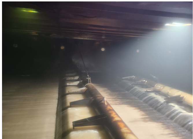
One (1) LED Light