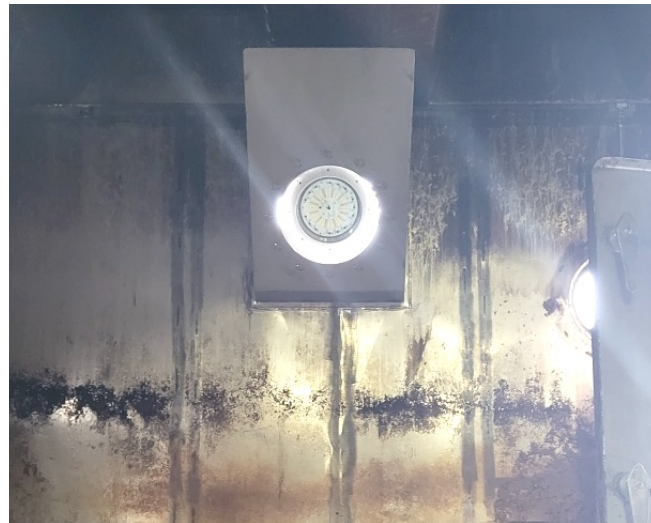
Inside Hood View