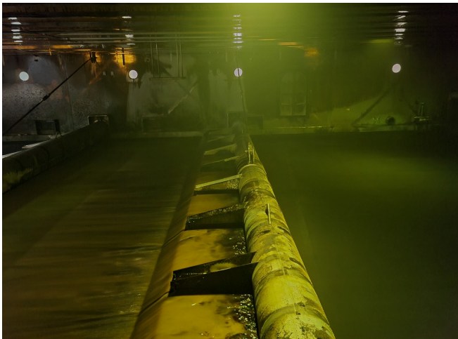
Two (2) Sodium Vapor Lights