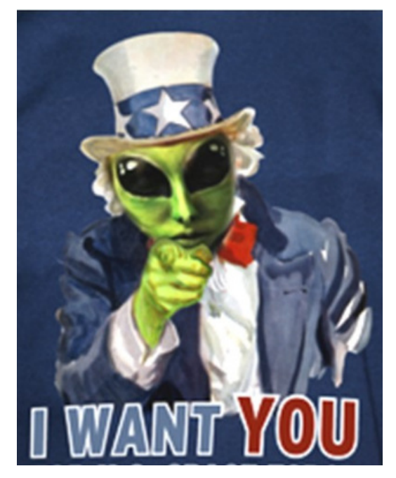
TO PAY LESS STATE TAXES!

Here are examples of how the program works.