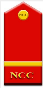
Cadet Under Officer