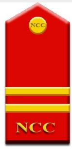
Cadet Senior Under Officer