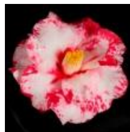
Adolphe Audusson Variegated