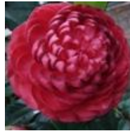
Kay Berridge Red