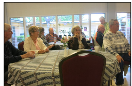
Pictures from our March Meeting! A fun time was had by all!! The ice cream wasn't bad either!!