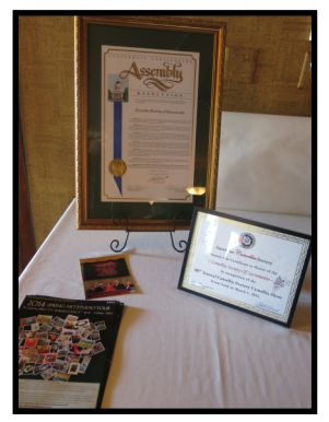
Some pictures from this past camellia season! These were taken at our end of year luncheon at the Club Pheasant!