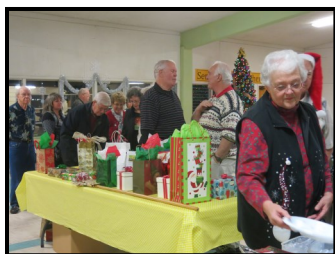
Photos from our December potluck