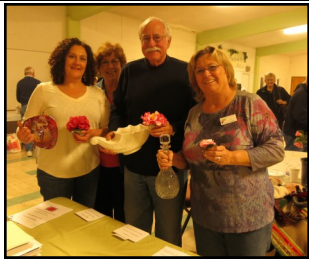
Mini Show winners