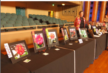
A few pictures from the Show!