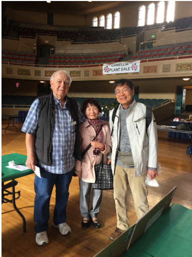
Japanese friends entered Alaskan Queen brought from Japan!