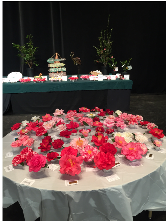
Beautiful Head Table Blooms