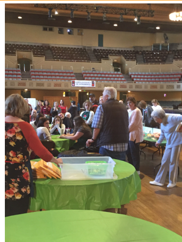
Ready, Set, Judge!