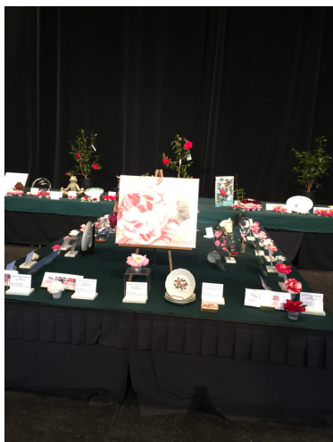
Our Lovely Trophy Table