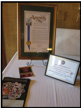
Some pictures from this past camellia season! These were taken at our end of year luncheon at the Club Pheasant!