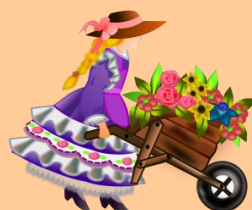
Photos from our first meeting

Don't forget to bring blooms to our meeting! Your name will be put in a basket and one person will win a plant. We only had three entrants in October. Your chances are great!! So watch your camellia blooms and see you on Monday, November 16th!