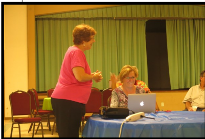
Sharing some laughs