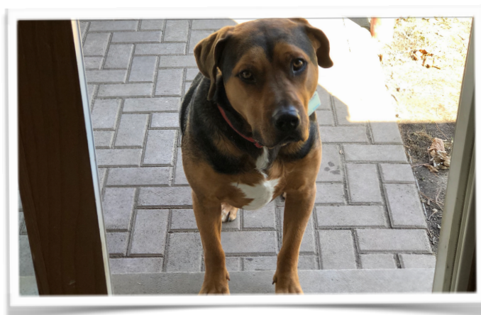
Memphis watches me from the patio door as I write

After reviewing my goals with my manager and editor, I am still confident in my ability to bring more of the Shadows Series to you, my lovely readers, around the two year anniversary of Born in Shadows . That being said, my main goal in April will be to complete the first draft.