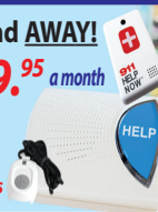
This Button SAVES Lives! As Shown GPS, Lowest Price Guaranteed!