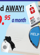
This Button SAVES Lives! As Shown GPS, Lowest Price Guaranteed!