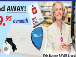
This Button SAVES Lives! As Shown GPS, Lowest Price Guaranteed!