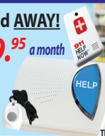
This Button SAVES Lives! As Shown GPS, Lowest Price Guaranteed!