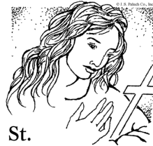
St. Mary Magdalene

Monday, July 22nd: Saint Mary Magdalene; died 1st century; healed of possession; disciple of Jesus and present at his crucifixion; in Mark, the first to witness to the risen Lord (hence, called the “apostle of the Apostles”); almost universally agreed today that her being identified as the sinful woman of Lk 7:36-50 is unfounded; patroness of the Order of Preachers (the Dominicans).