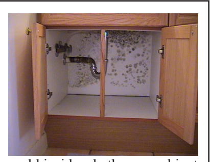
mold inside a bathroom cabinet