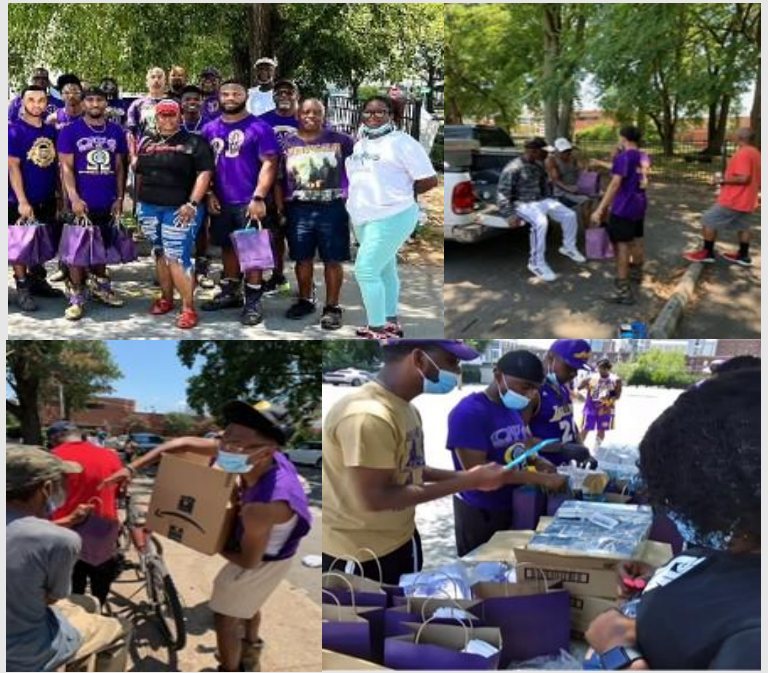
Above is part of the crew from AE and Nexus Church of Charlotte who partnered to provide direct outreach service to the community,

( Lambda Epsilon, Continued from page 2 )