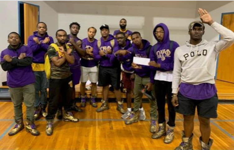
AE State of Alabama March Down Champs pose with 1st Place Check

AE Undergraduates attended the 46 th Annual State of Alabama Meeting October 15, 2022, in Dothan, AL where they were awarded the Highest-Grade Point Average (GPA) Award. This accomplishment marks the 5 th consecutive year that Lambda Epsilon has earned this award for the State of Alabama.