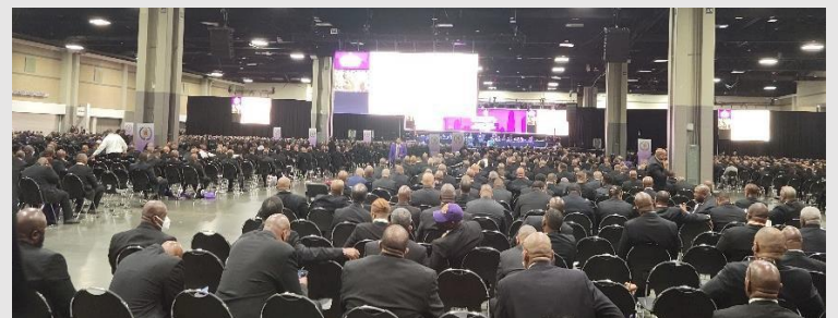
Thousands of Omega men inside the Charlotte Convention Center taking care of the business of Omega Psi Phi Fraternity, Inc.