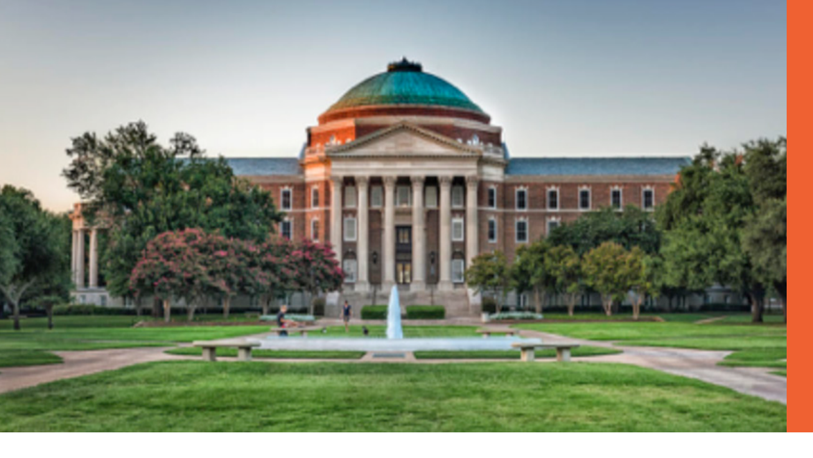
The Hunt Institute for Engineering & Humanity is a unique action-oriented community of thinkers and doers focused on sustainable development at Southern Methodist University. The Inclusive Economy Consortium (IEC) is an initiative of the Hunt Institute for Engineering & Humanity at Southern Methodist University.