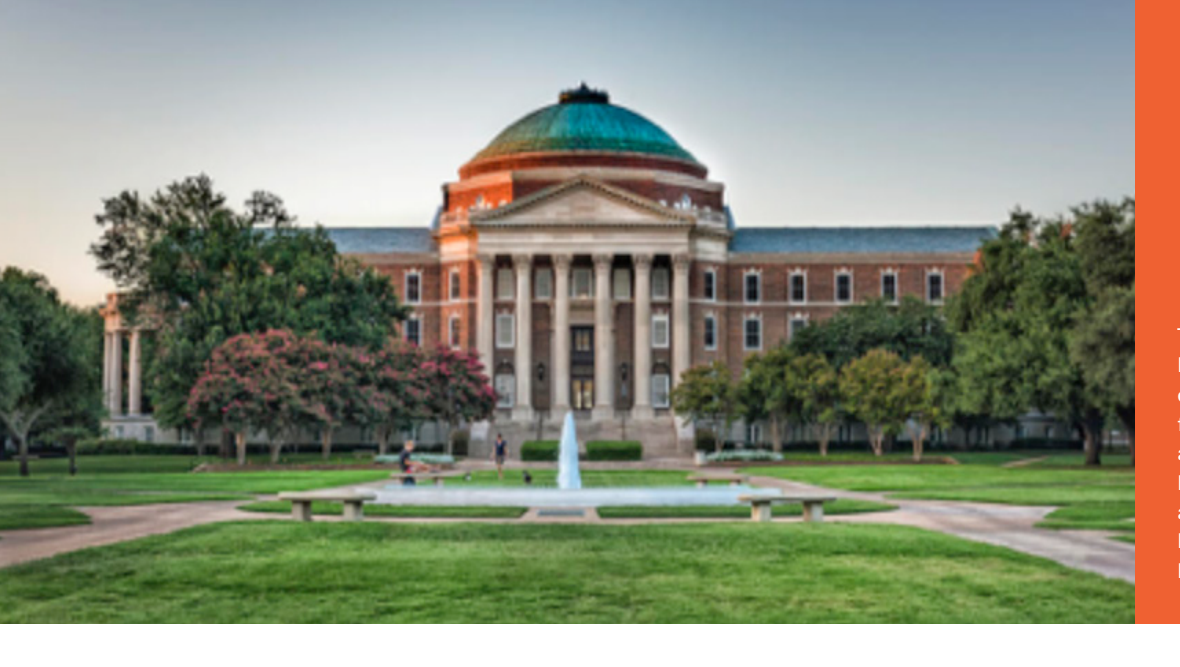
The Hunt Institute for Engineering & Humanity is a unique action-oriented community of thinkers and doers focused on sustainable development at Southern Methodist University. The Inclusive Economy Consortium (IEC) is an initiative of the Hunt Institute for Engineering & Humanity at Southern Methodist University.