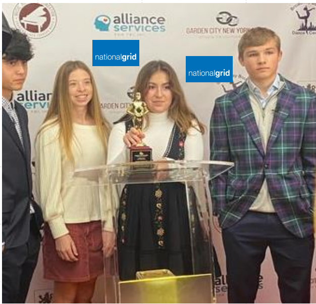
Hometown Hero Award Recipients