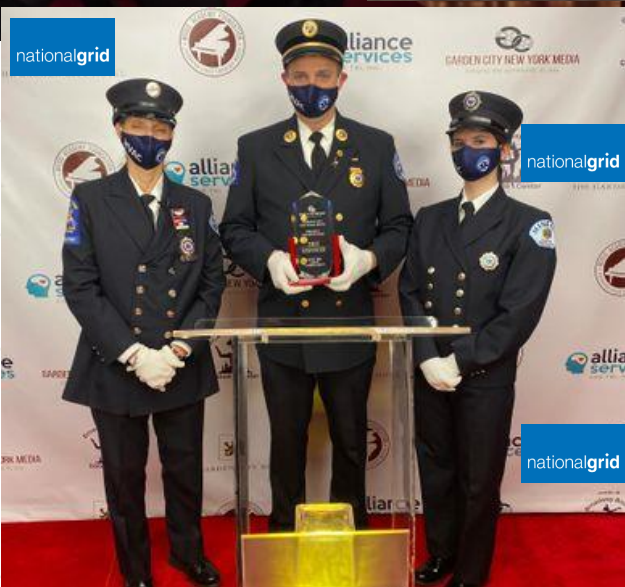
First Responder Award Recipients