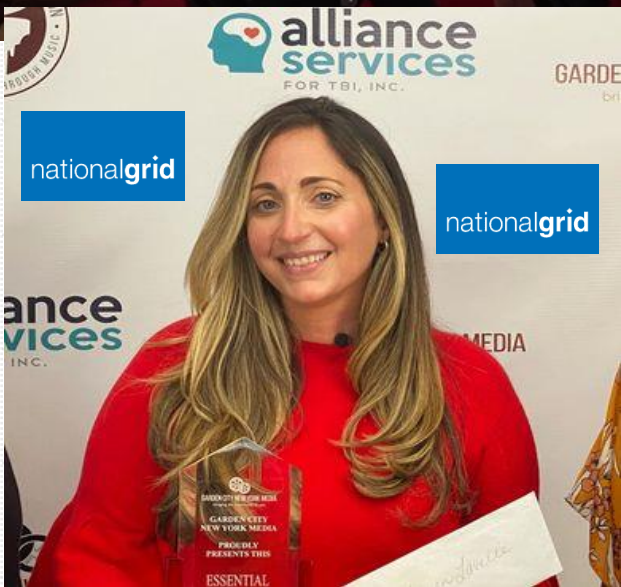
Essential Worker Award Recipient