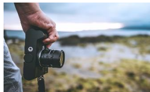
Photo & Song Selection