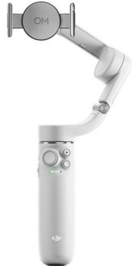
DJI OM 5 Smartphone Gimbal (Athens Gray) $159.00 at B&H