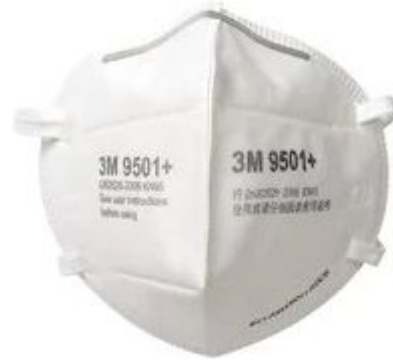
3M™ Particulate Respirator 9501+