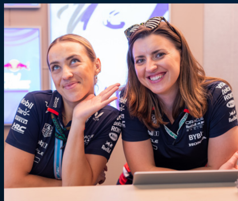
ARRIVAL CHECK IN