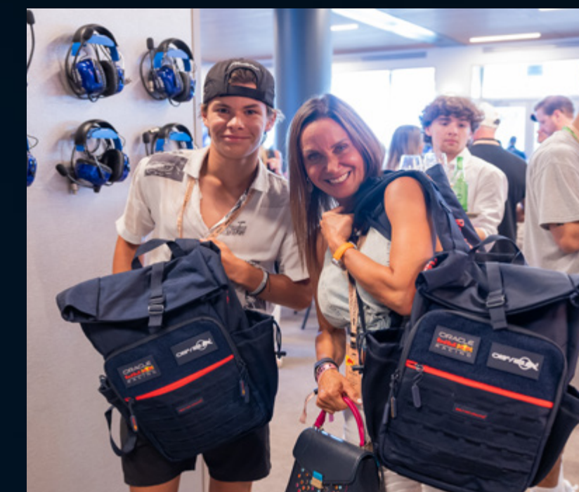
DEPARTURE AND GIFT BAG