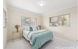
Two private Lower-Level Bedrooms – The downstairs level offers a sense of privacy and independence, complete with a large wet bar.