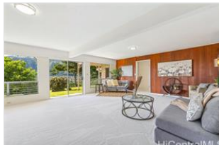
Spacious & Inviting – The open living area on the downstairs level is perfect for gatherings, offering a warm and welcoming atmosphere.