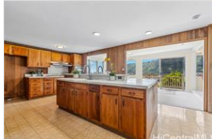
Warm & Welcoming – The lovingly maintained interior offers charm, character, and endless possibilities for customization.