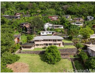
Expansive Estate – Situated on a rare 14,000+ sq. ft. lot, this property offers endless opportunities for landscaping, gardening, or expansion.