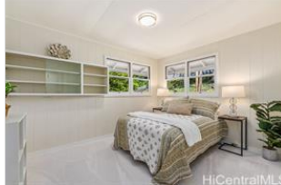
Flexible 5-Bedroom Layout – Perfect for growing families, home offices, or multigenerational living.