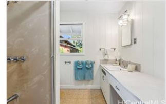
The upstairs full bathroom plus a convenient half bathroom off the kitchen area adds extra functionality.