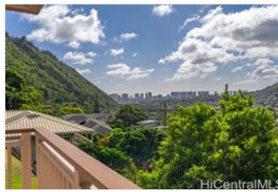
Breathtaking Views – Wake up to stunning panoramic views of the mountains, city, and ocean from this exceptional Manoa-Woodlawn estate.