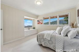
Primary Bedroom Retreat – Wake up to stunning views and enjoy direct access to outdoor spaces.