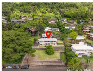
Prestigious Neighborhood – Nestled in the highly coveted Manoa-Woodlawn area, enjoy elevated island living at its finest.