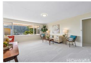
Elegant Upper-Level Living Room. Expansive windows bring in natural light and frame spectacular city and ocean views.