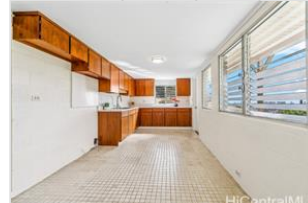
Large Wet Bar – The wet bar on the lower level is bathed in natural light, creating a bright and inviting space perfect for entertaining, casual dining, or multi-generational living.