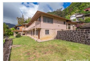
Expansive Green Space – With ample room to roam, this large yard is perfect for outdoor gatherings, pets, or simply enjoying the beauty of nature.