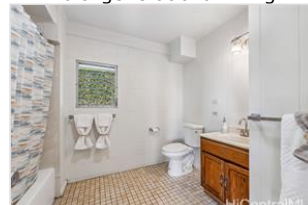
Generously sized downstairs bathroom