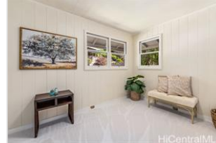
Charming & versatile 3rd upstairs bedroom offers flexibility to suit your needs.