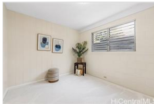
Bright & Spacious primary bedroom – Generously sized rooms provide comfort and versatility for any lifestyle.