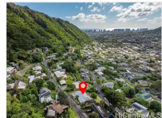
Lush Tropical Setting – Surrounded by mature trees and greenery, this home offers unparalleled privacy and serenity.