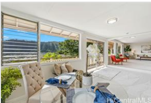
Dining with a View – Enjoy meals with a backdrop of lush mountains and sparkling city lights.