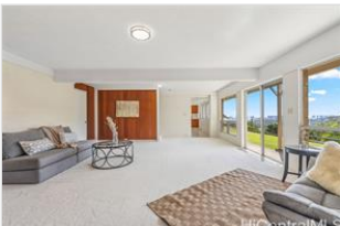
Views from Every Window even from downstairs! Breathtaking mountain, city, and ocean views, bringing the beauty of the city, ocean, Manoa Valley and the mountains indoors.