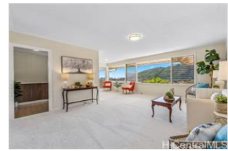
Seamless Indoor-Outdoor Flow – Step out from the spacious living room to enjoy breathtaking scenery from the lanai.