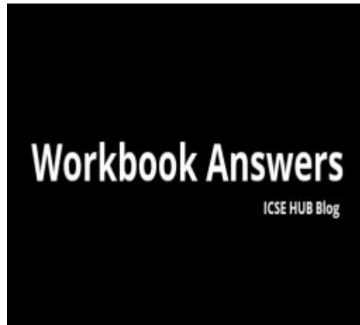
Treasure Trove Workbook Answers

Themes of "Hearts and Hands" The main theme of the story is kindness. The real marshal is a kind man who spares Mr. Easton, as well as Miss Fairchild, some embarrassment with no ulterior motives at all. He gains nothing from doing this.