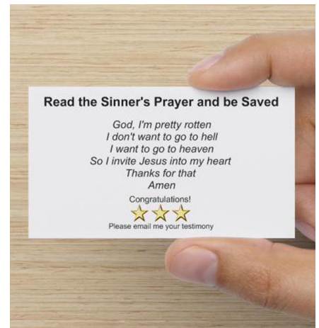
Is this what the Bible says?

It is not found in the writings of church leaders of the second, third, fourth, fifth, sixth, etc. centuries! It was never used for fifteen hundred years after the church began. It is not from the mind of God but from the imagination of mere mortals.