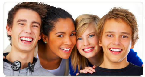
When is a person accountable?

Is there a specific, set age for when that time of accountability occurs? No, because each person is different. When each of us becomes accountable for our actions and choices depends upon a variety of social and environmental factors. Children mature at different rates and ages as their spirits are fashioned, shaped, and molded by parents, teachers, and life’s experiences. That’s why there is no set age of accountability.