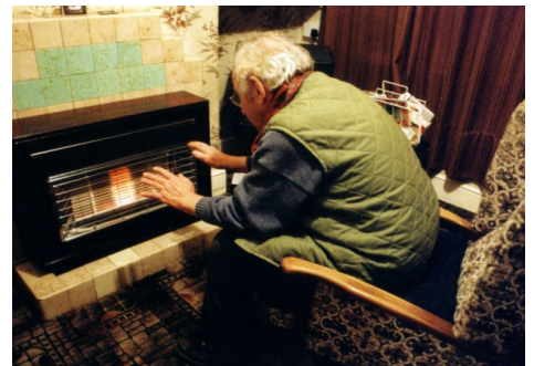
Do you have the mindset of how can I serve?

The lawyer probably recognized that there were people in his life that he was not loving as he should. And so we read, “But he, wanting to justify himself, said to Jesus, ‘And who is my neighbor?’” ( Luke 10:29 )