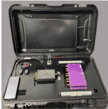
VAMPIRE SYSTEM DURING PRODUCTION.

ALL SYSTEMS ASSEMBLED IN THE UNITED STATES OF AMERICA