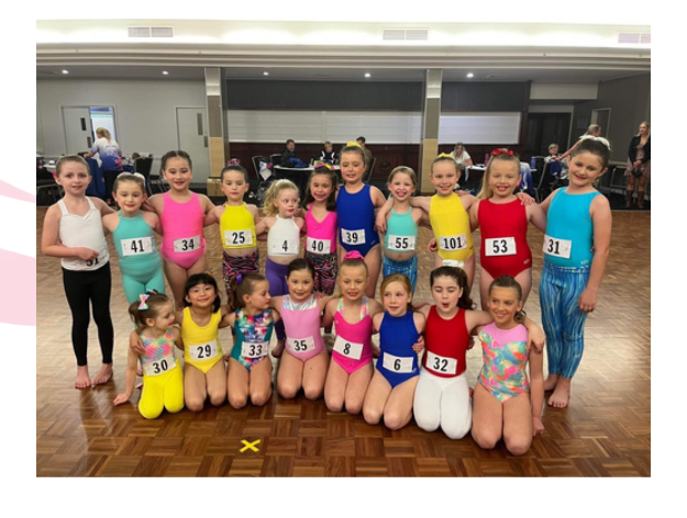
Some of our Juniors at Medal Comp