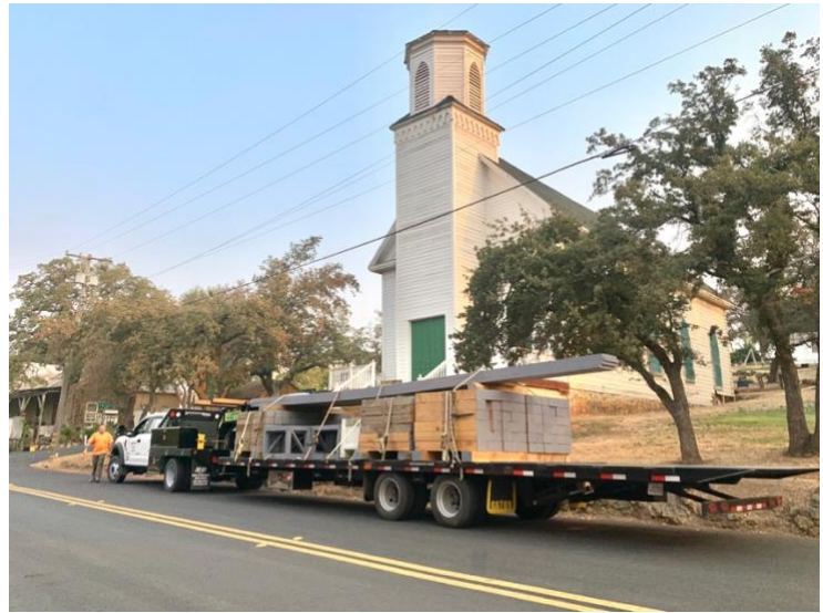
Montgomery Structural Lifters