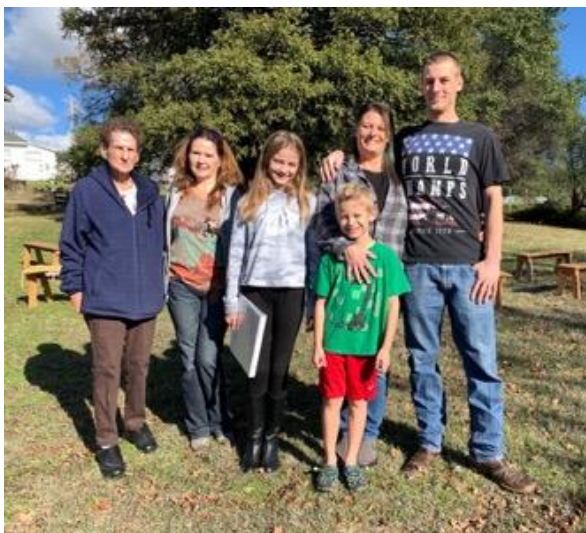
Five generations of Madison's family!