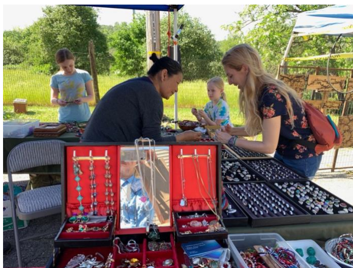
One of the interesting vending booths