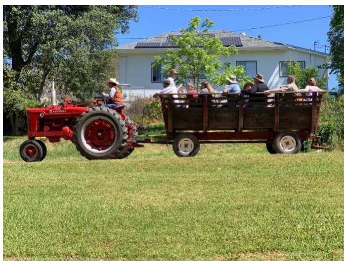
The ever popular mining tour heading back