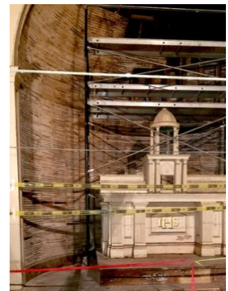
Aurel Onut, Byzantine Painting Studio