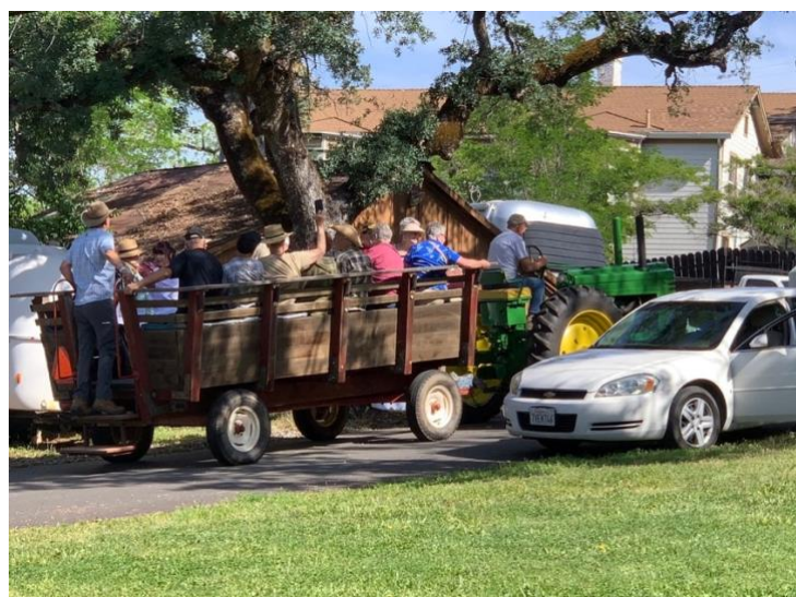
The mining tour is always a favorite.