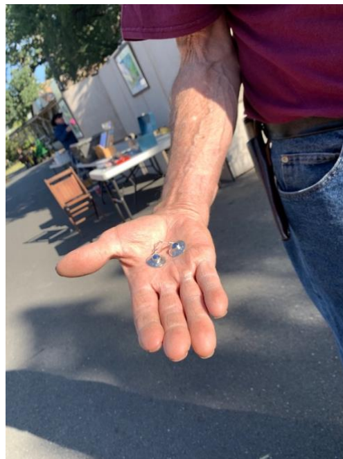
Collecting and delivering raffle prizes is an annual tradition.