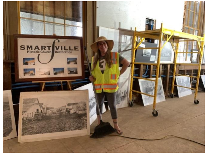
Preparation for Pioneer Day is major work.