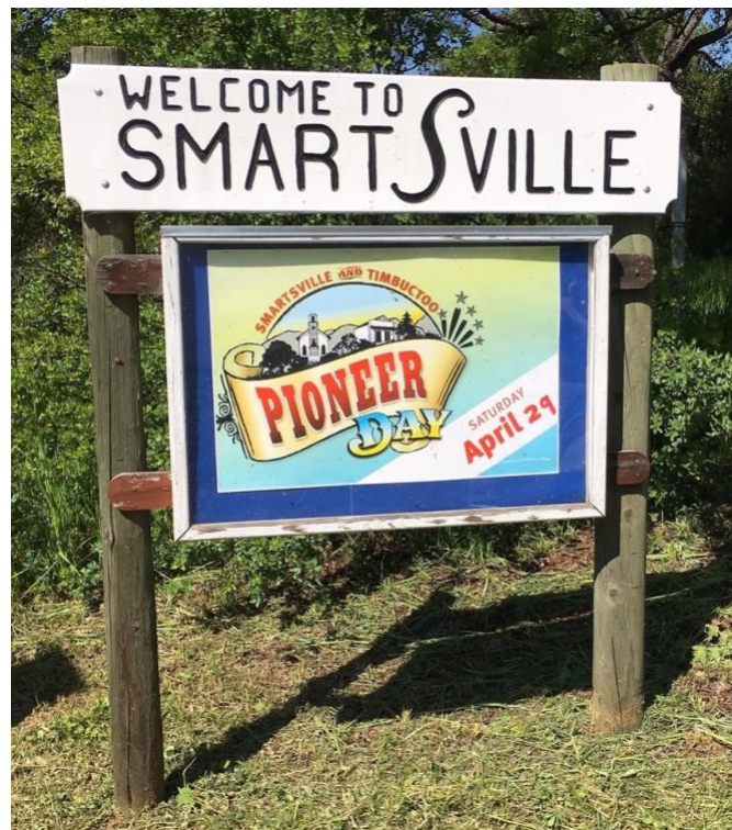
Fortunately, we still have this sign on the east end of town.