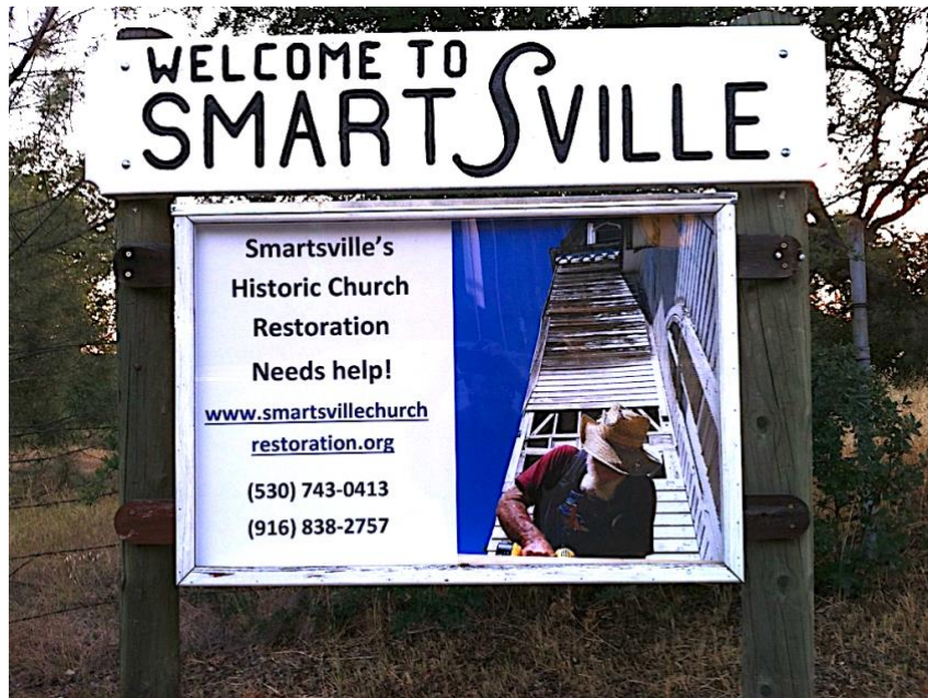
This is the one that went missing.