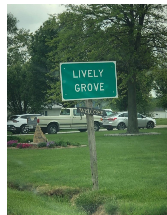
Lively Grove Community in Illinois