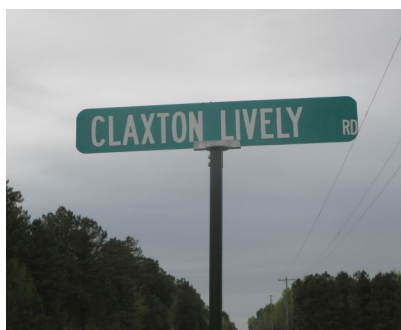
Claxton-Lively Road in Burke County, GA