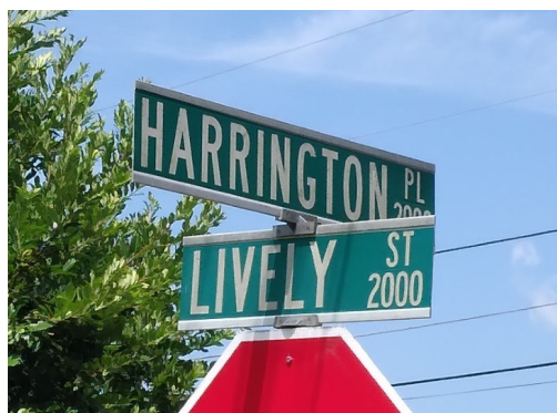
Lively Street in Augusta, Georgia