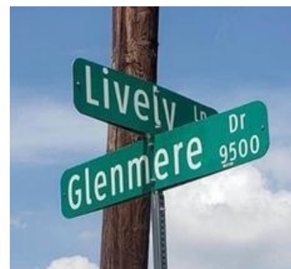
Lively Lane in Dallas, Texas