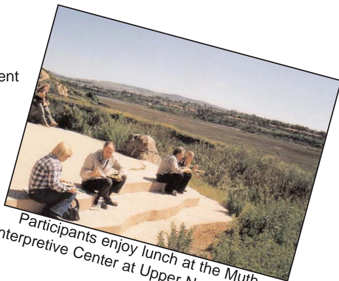
Participants enjoy lunch at the Muth Interpretive Center at Upper Newport Bay.