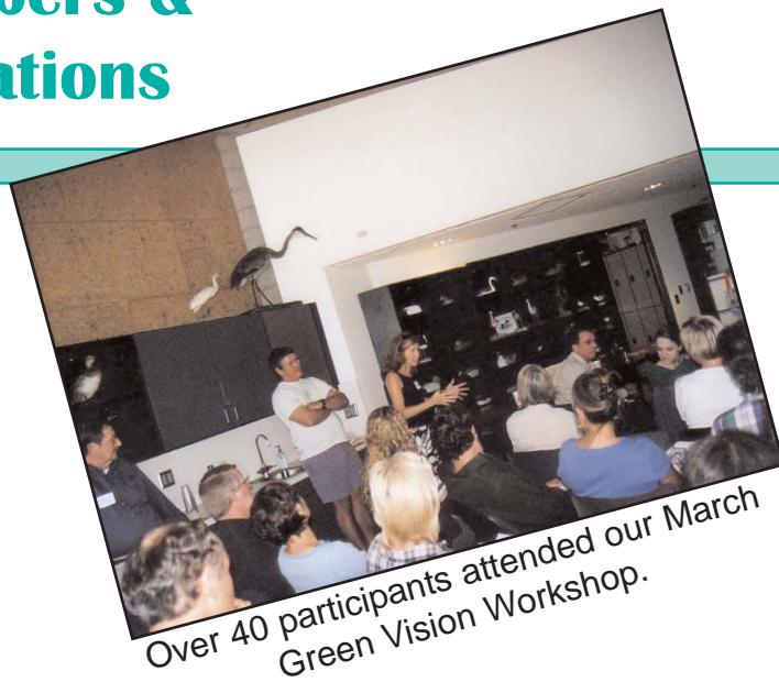
Over 40 participants attended our March Green Vision Workshop.