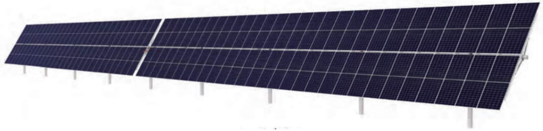
Figure 3-1: Typical View of PV, Tracker and Racking Set Up 2

cabling to the main transformer situated in the substation yard, which will step up the voltage from 34.5 kV to 115 kV. Electricity will then flow from the substation yard through overhead electrical lines and connect to the transmission line at 115 kV.