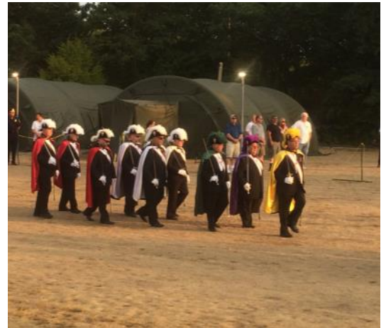
Honor Guard at the Moving Wall Opening Ceremonies.

Also note a change of meeting locations for September and October. The installation of assembly officers will take place at the October meeting at Our Lady's in Waltham.