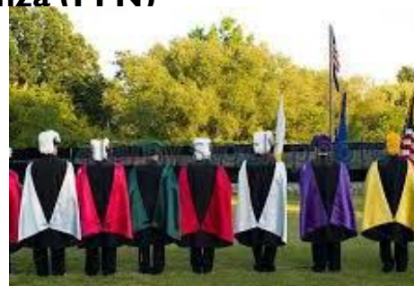
Archive File Photo

first outing. Well Done! Both Opening and Closing days were blazing hot. Fortunately, air conditioned Quonset tents were provided along with bottled water. We had a good showing with members from other assemblies participating.