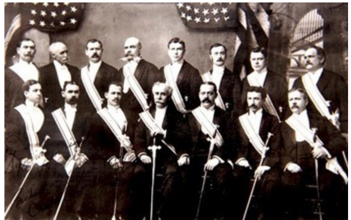
First Exemplification Feb 22, 1900

February 22, 2017 marks the 117 anniversary of the first Fourth Degree exemplification. Originally scheduled for the Astor Hotel in New York City, it had to be moved to the Lenox Lyceum where 1,100 candidates received their Fourth Degree. The Second exemplification was held in Boston three months later where another 750 Third Degree knights became Sir Knights.