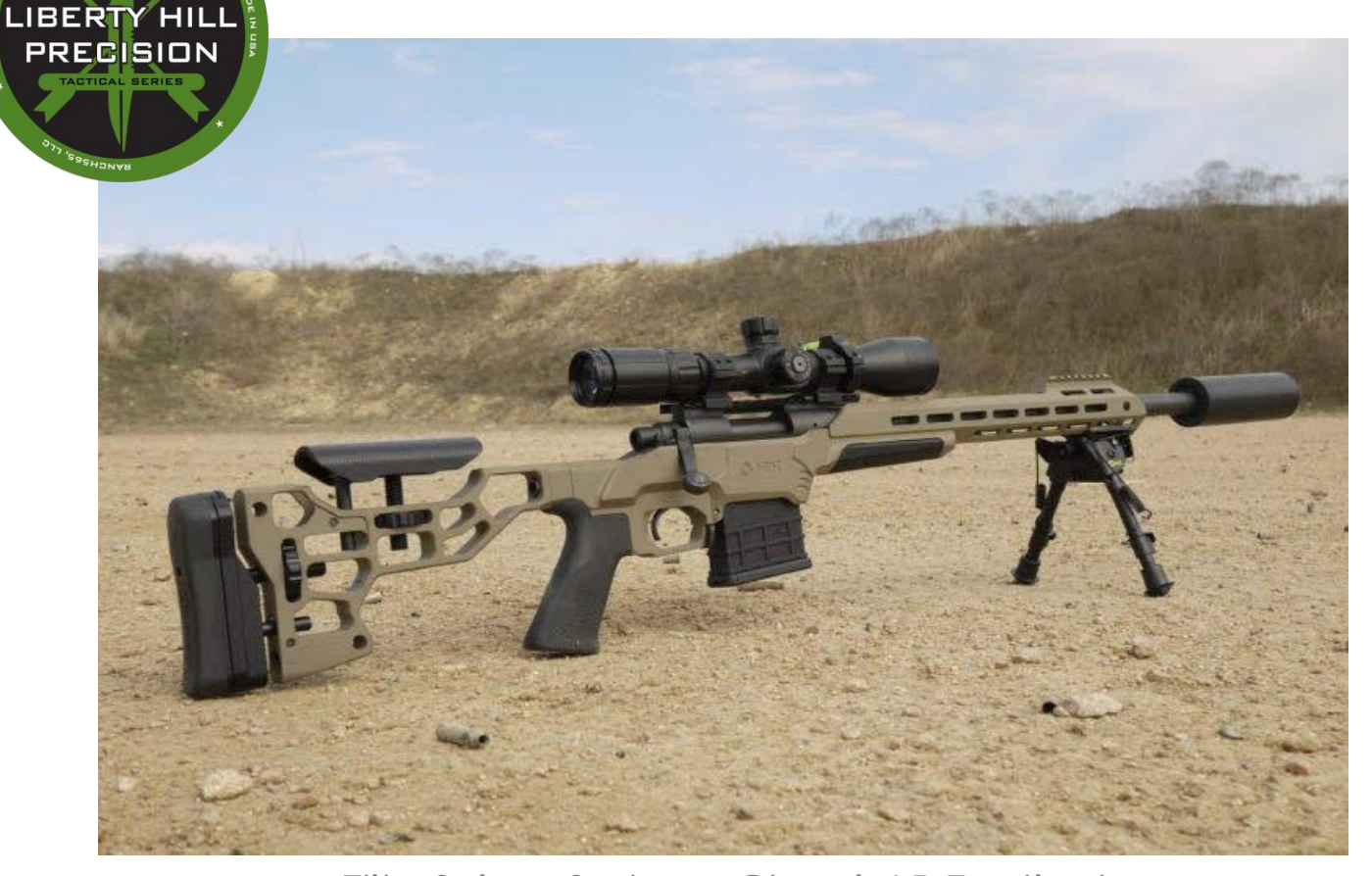
Elite Sniper Systems Chassis LR Tactical