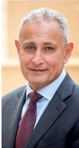
Nasser Kamel Secretary General Union for the Mediterranean

The Euro-Mediterranean region finds itself at a pivotal juncture, defined by the vibrant energy of its youthful population and the complex challenges that loom over its promising demographic landscape. With an extraordinary one in three individuals under the age of 25, rising to nearly half in the Southern and Eastern Mediterranean countries, the region is at the forefront of a unique youth-driven narrative, holding the key to our collective destiny.