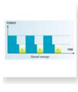
Delay second stop (2)