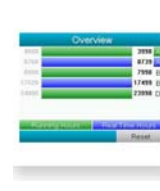
Graphic serverplan indicator (5)