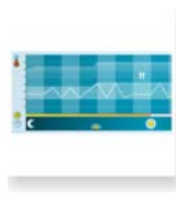
Saver cycle (3)