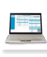
Free online website (6)