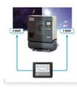
Dual setpoint (4)