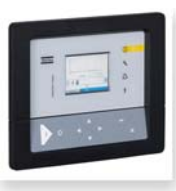
Real time trending (1)